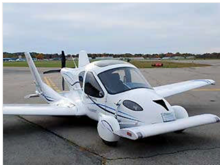
The Terrafugia Transition